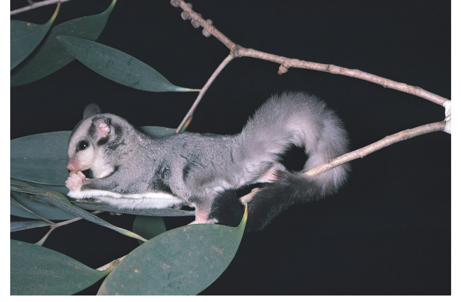
Squirrel Glider, Photo sourced: Gregory Millen, Australian Museum

"It is an essential habitat for squirrel gliders, which is a species we have been focusing on a lot. They need connectivity of bushland and hollow trees to survive.